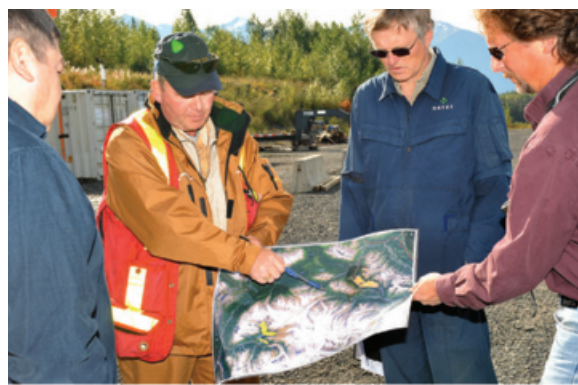
Taking people to see the proposed site was an important part of gathering feedback on the KSM Project's design.

Fronk concludes, "Everyone's participation and input has resulted in what we consider to be a strong application for a technically and environmentally feasible project. We look forward to a timely and fair review of our EA application / EIS submission, and will continue to work cooperatively and closely with all those involved, as we enter this next stage in the KSM Project's development."