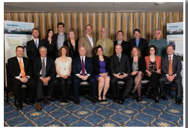
Seabridge team members

During the five-year construction process $3.5 billion will be spent directly in BC for goods and