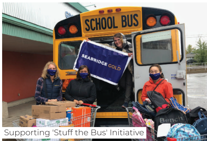
Supporting 'Stuff the Bus' Initiative