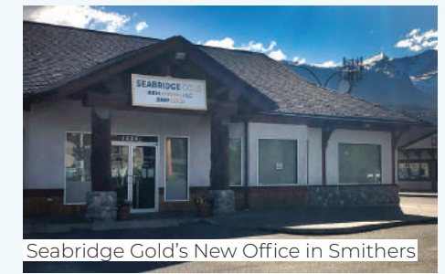
Seabridge Gold's New Office in Smithers