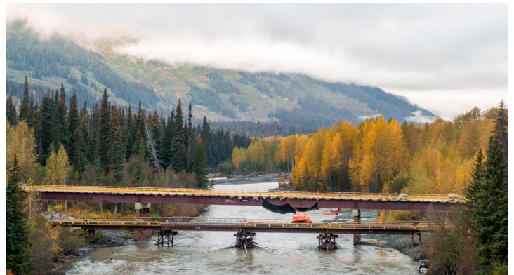
Bell Irving River Bridge Installation