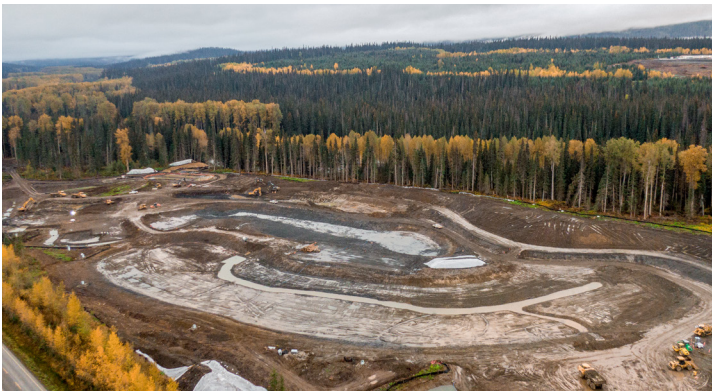
Construction of Glacier Fish Habitat Offset Ponds