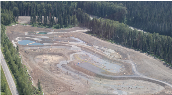
Construction of Glacier Fish Habitat Offset Ponds