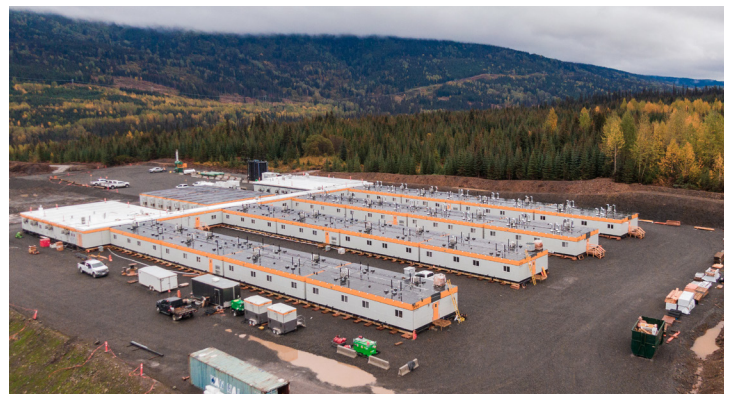
Construction of Camp 11

KSM MINING ULC A SUBSIDIARY OF SEABRIDGE GOLD INC.