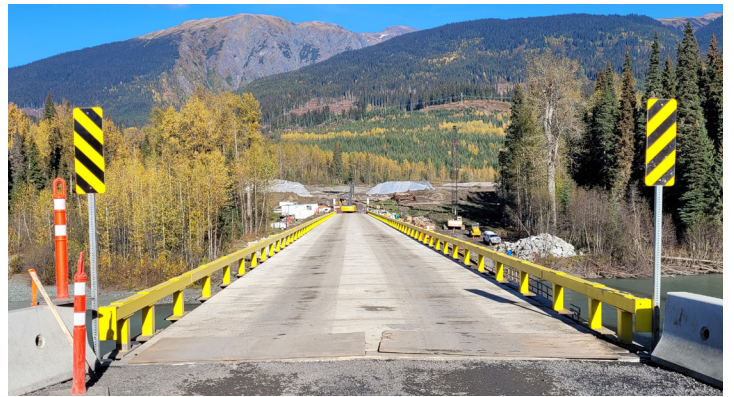
Bell Irving River Bridge Installation