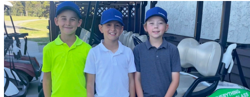
Junior Golf Program Run by Smithers Golf and Country Club