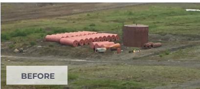
Demolition of the Mill Building