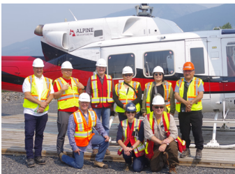
Members of the Nisga'a Nation at the KSM Project