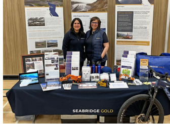
Dease Lake Job Fair & Resource Forum