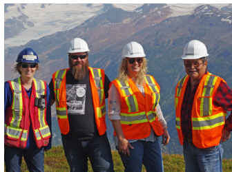
District of Stewart Representative & Gitksan Nation Member at KSM Project