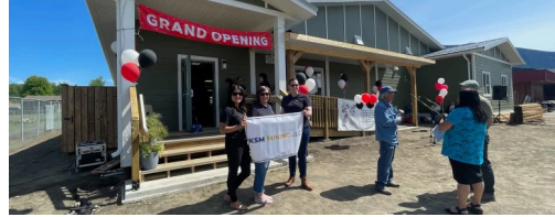
A New Childcare Centre in Gitwangak

Seabridge is more than a local employer, we're also a member of the communities where we operate and are committed to giving back in a meaningful way. Since 2011, we have contributed $1.3+ million to support projects, events and programs that enhance the well-being of the communities. This year, some of the projects we have proudly supported include: