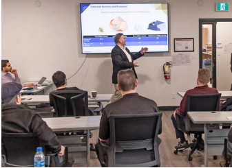
Open House in Terrace

We would like to sincerely thank everyone who attended our community open house in Terrace, visited our project sites, and stopped at our booth at various local events and career fairs to learn more about our Projects. Your interest is deeply appreciated, and we value the opportunity to connect with you directly.